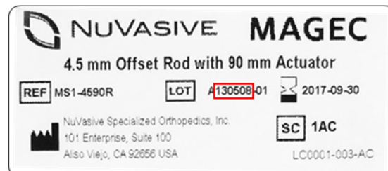
Figure 2: Representative patient chart label showing device lot number. The 6-digit numerical string (e.g. 130508) is indicated by the red box.